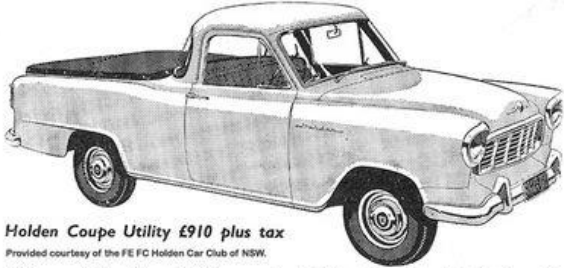
Holden Coupe Utility £910 plus tax